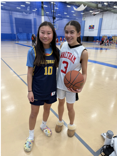
An unexpected Halos 2024 reunion for Ella L and Kiana W when their schools played each other at a basketball game.