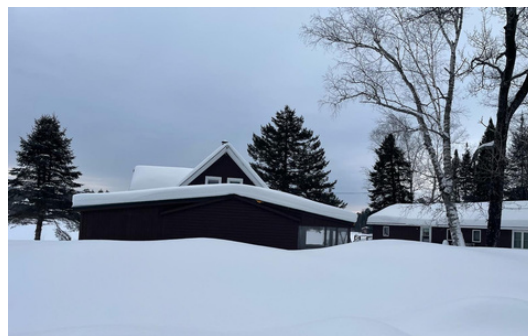
Check out all the snow camp got this winter! Not great conditions for canoeing or kayaking...